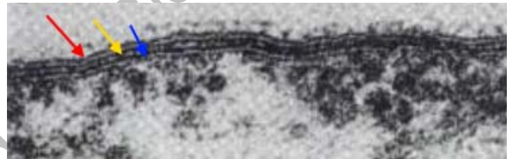
Figure 2. A transmission electron micrograph revealing the cell envelope of R. prowazekii . The red arrow points to the outer layer, the yellow arrow points to the thin electron-dense rigid cell wall, and the blue arrow points to the innermost cytoplasmic membrane [X 196 000]. Obtained from Yu & Walker (2005).

Intracellular R. prowazekii often appear as short, paired or single, lanceolate-to-ovoid coccobacilli (Raoult et al. , 2004). To undergo cellular respiration, this species requires oxygen as a terminal electron acceptor. Its envelope consists of three major layers: an innermost cytoplasmic membrane, a thin electron-dense rigid cell wall containing peptidoglycan, and an outer layer, which contains lipopolysaccharide endotoxin (Yu & Walker, 2005) and immunodominant surface-exposed proteins that provide structure or potentially contribute to host cell adhesion or other host cell interactions (Figure 2) (Raoult et al. , 2004). Cells of R. prowazekii also possess intracytoplasmic invaginations of the plasma membrane – a morphological feature that resembles cristae found in the mitochondria. Unlike the mitochondria, however, members of this species possess a flagellum for motility – a feature not common among the family Rickettsiaceae (Yu & Walker, 2005).