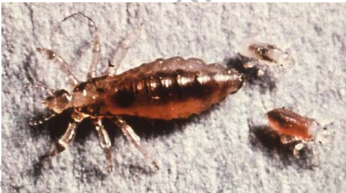
Figure 1. This image shows an adult female human body louse ( Pediculus humanus humanus ) along with two larval young.

Rickettsia prowazekii is the pathogenic bacterium responsible for epidemic typhus fever, an infectious disease that has plagued humans ever since it was first recorded in Europe nearly 1000 years ago (Szybalski, 1999). More recently, R. prowazekii is estimated to have infected nearly 30 million humans following the First and Second World War (Andersson et al. , 1998), and continues to pose a major health threat in certain parts of the world, despite the availability of antibiotics. R. prowazekii is typically transmitted to humans by the body louse – an obligate ectoparasitic arthropod (Figure 1) (Baxter, 1996). In its vegetative state, the pleomorphic R. prowazekii is 0.3 \mu\text{m} to 0.5 \mu\text{m} by 0.8 \mu\text{m} to 2.0 \mu\text{m} in size (Walker, 1998), which makes this species too small to be clearly seen under an ordinary light microscope. R. prowazekii belongs to a large group of Gram-negative bacteria known as \alpha -proteobacteria that multiply in eukaryotic cells. This suggests that they can only grow and reproduce within the living cells of their host. Although classified as Gram-negative bacteria, R. prowazekii are poorly stained by the Gram method and are better visualized using the Giemsa or Giménez stains (Raoult et al. , 2004).